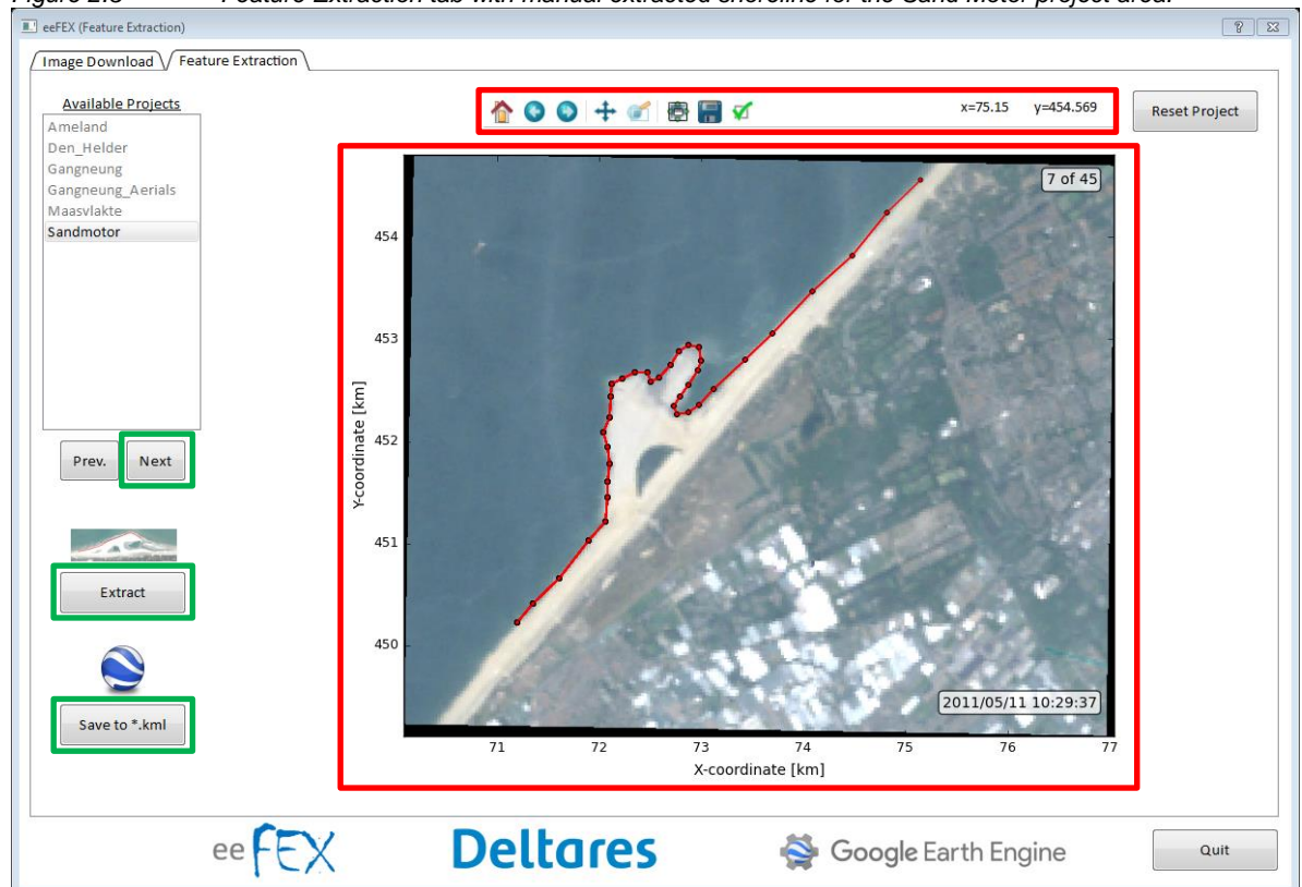
Figure 2.3 Feature Extraction tab with manual extracted shoreline for the Sand Motor project area.

Features can be extracted manually once the selected satellite images are downloaded to the local project folder. Click on the tab Feature Extraction (Figure 2.3).